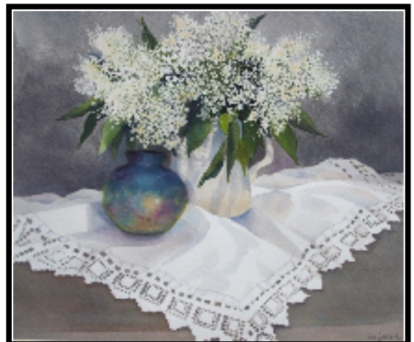
Elderflowers Watercolour 41 x 38cms unframed

Use the back arrow of your browser to return to List of Members.