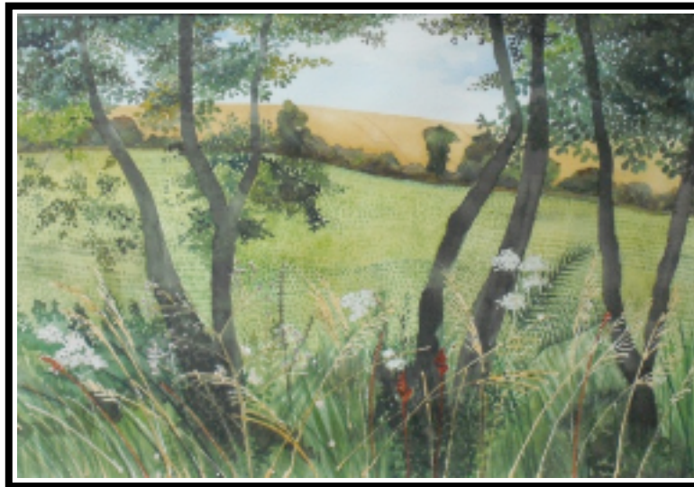
Below An Irish summer Watercolour 36 x 53cms unframed