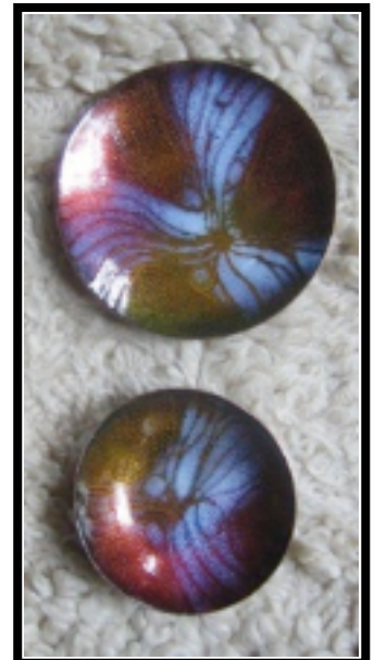
Two small enamel dishes (right)